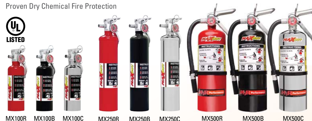
MX100R MX100B MX100C MX250R MX250B MX250C MX500R MX500B MX500C