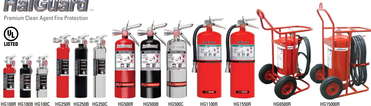
HG100R HG100B HG100C HG250R HG250B HG250C HG500R HG500B HG500C HG1100R HG1550R HG6500R HG15000R