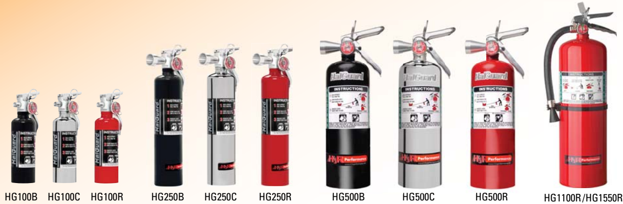
HG100B HG100C HG100R HG250B HG250C HG250R HG500B HG500C HG500R HG1100R/HG1550R