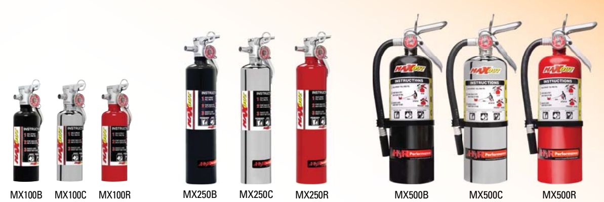
MX100B MX100C MX100R MX250B MX250C MX250R MX500B MX500C MX500R